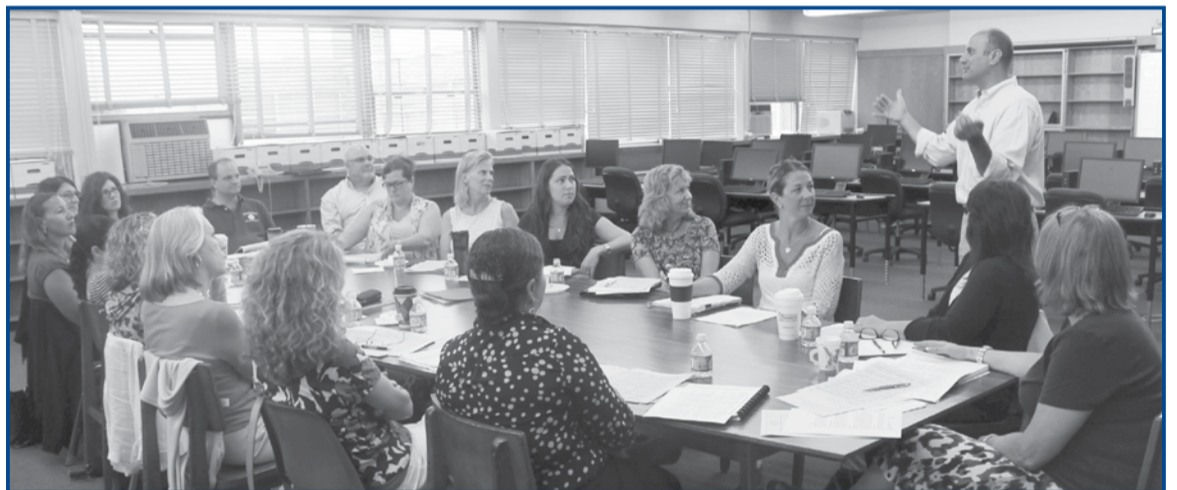
Administrators and department leaders work together to rewrite curricular material to align with the CCLS.