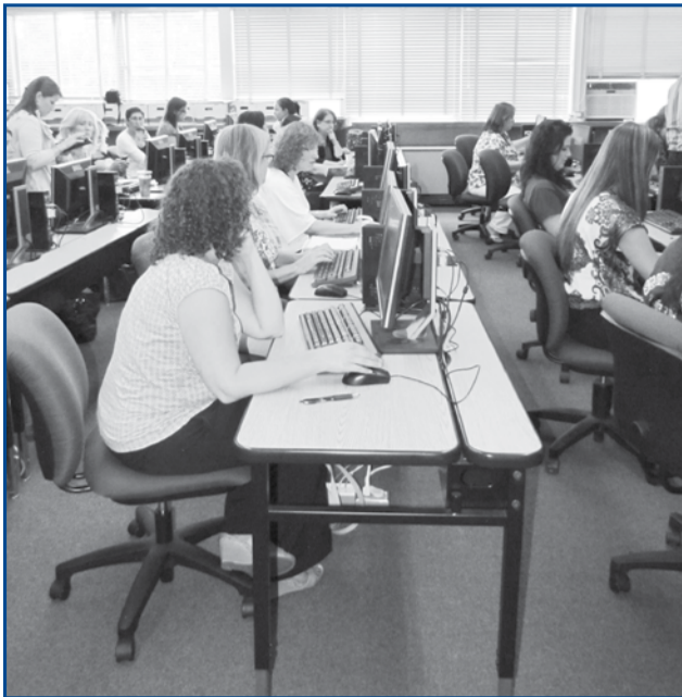
Teachers participate in a workshop on Edmodo as part of the Professional Development Academy.

The new Professional Development Academy gives educators throughout the district the opportunity to participate in several different workshops this fall. These workshops enrich teachers with a vast range of information during after-school sessions taught by colleagues knowledgeable in a specific subject area.