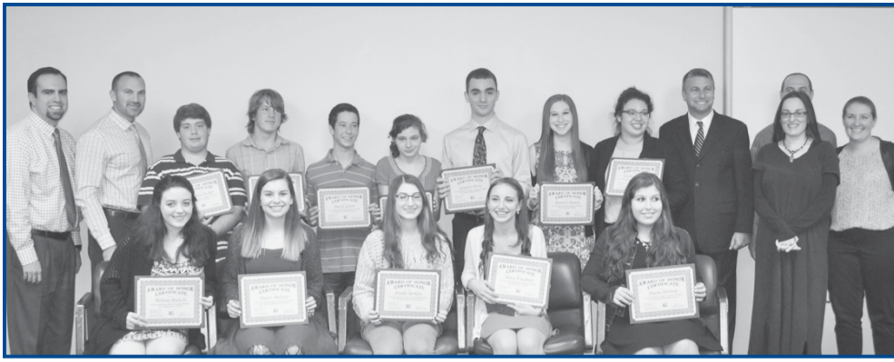
All-State musicians and alternates with their music teachers.