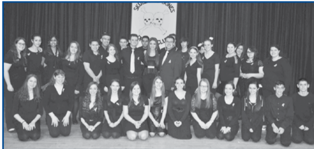
Members of the Skull and Bones Drama Club at Mepham performed in the fourth annual revue production, "A Night on Broadway."

The students selected, staged and rehearsed their own scenes from a range of Broadway productions. Students performed everything from "Wicked's" "The Wizard and I," "Aladdin's" "A Whole New World" and "Rent's" "Seasons of Love" to "Pippin's" "With You" and "Peter Pan's" "I've Gotta Crow." Musical performances spanned a variety of famous musicals, genres and eras, with each student demonstrating his or her unique talents in the performances.