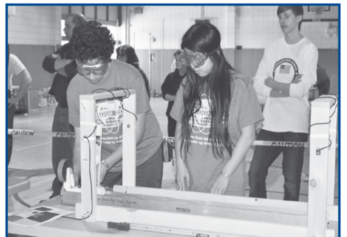
Calhoun students competed in the maglev competition during the Science Olympiad Eastern Nassau County Regional Competition.