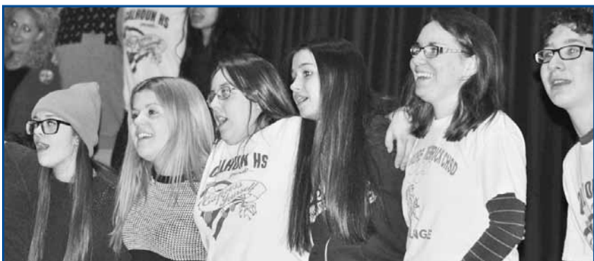
Members of the choral group Express Yourself performed at the transition fair.

Attendees were able to select workshops to attend from a diverse list, which included Medicaid Service Coordination, Waivers, Recreation and Crisis Services; Supplemental Security Income and Medicaid; Travel Training and Able Ride, Self-Determination and Consolidated Support Services; Pre-Vocational Training and Day Programs; and Special Needs Trust and Legal Guardianship. Additionally, several current and former students from Prep for the Future spoke during a special student workshop about their prevocational and vocational experiences. All workshops were led by experts in the field of disabilities rights and services.