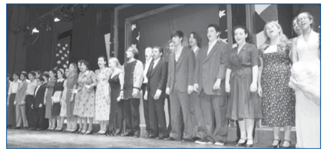
Members of the On Tour Company performed in "Pins and Needles."