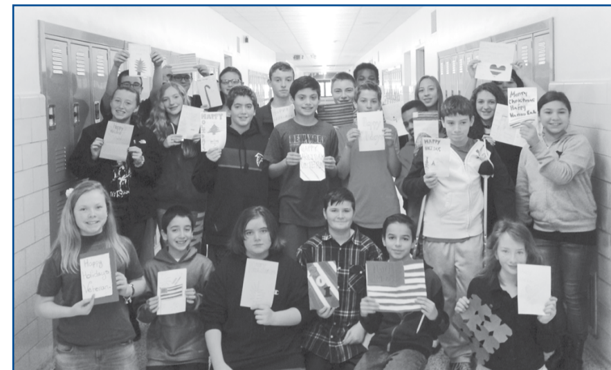
Seventh-grade students in Meg Walsh's second-period class at Grand Avenue Middle School.

More than 200 cards flooded in from Grand Avenue Middle School alone and were added to a mounting pile they already received from the other schools in the district, bringing the total to 1,000 cards for veterans.