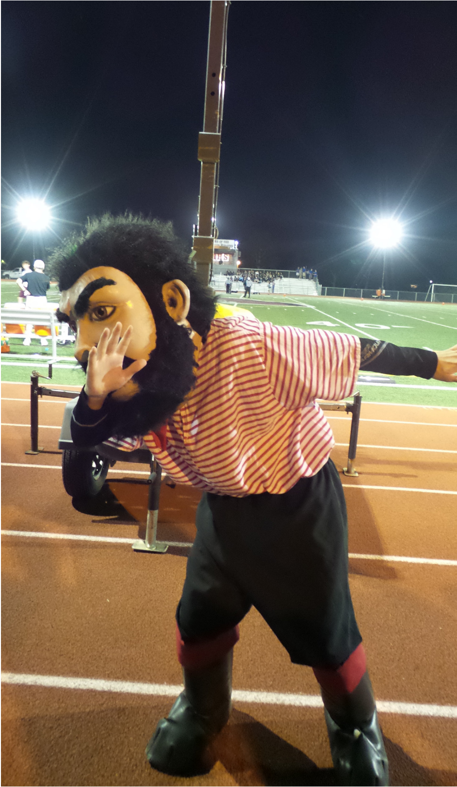
The Pirate dabs for the crowd.