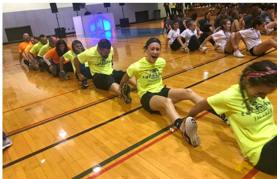
The teachers compete in the caterpillar relay.