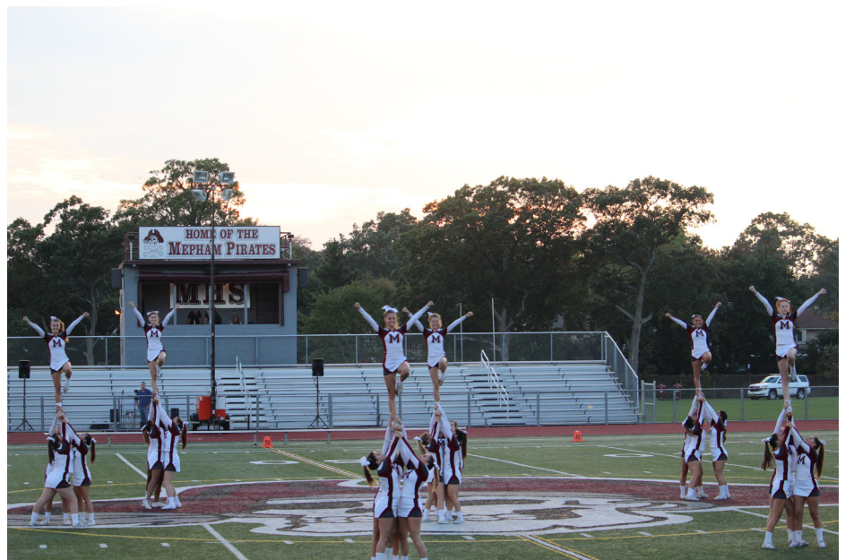
The cheerleaders perform at Pep Rally.