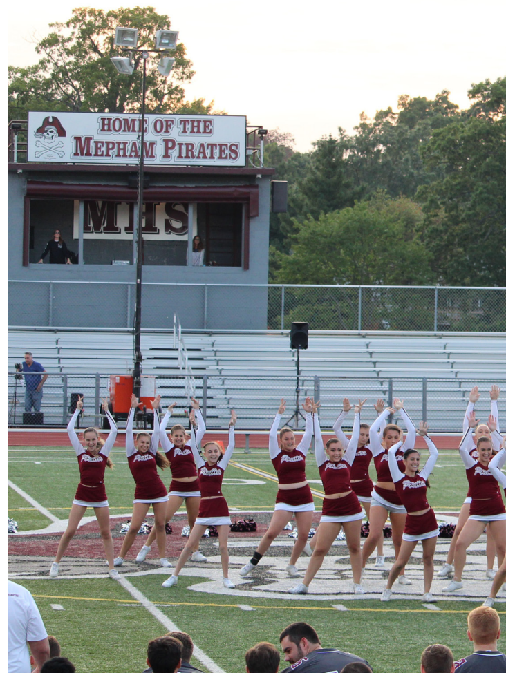
The kickline team performs at Pep Rally.