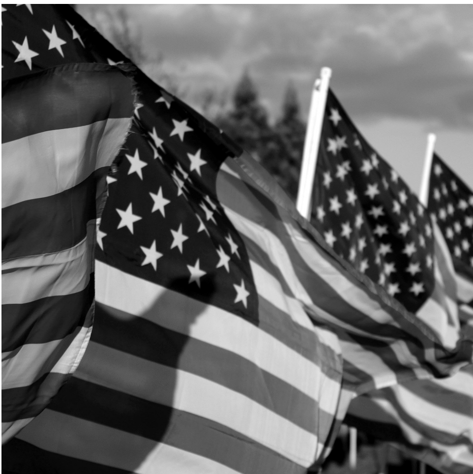
Junior Photography 3/4 Student Nathan Degree captures the beauty of Mephams’ Field of Honor.