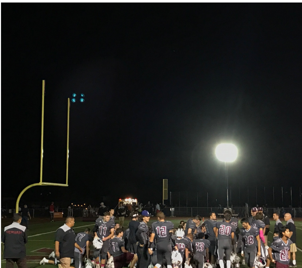
The Pirates gather after the homecoming victory.