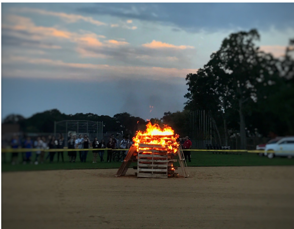
The bonfire rages on the softball field.

Homecoming began shortly after the bonfire, with it being obvious that the Mepham Pirates would win the game. The crowd roared every time Mepham made a touchdown. Many Mepham parents representing the PTA and Sports Boosters also sold Mepham merchandise. Mepham students enjoyed the festival, Pep Rally, and Homecoming.