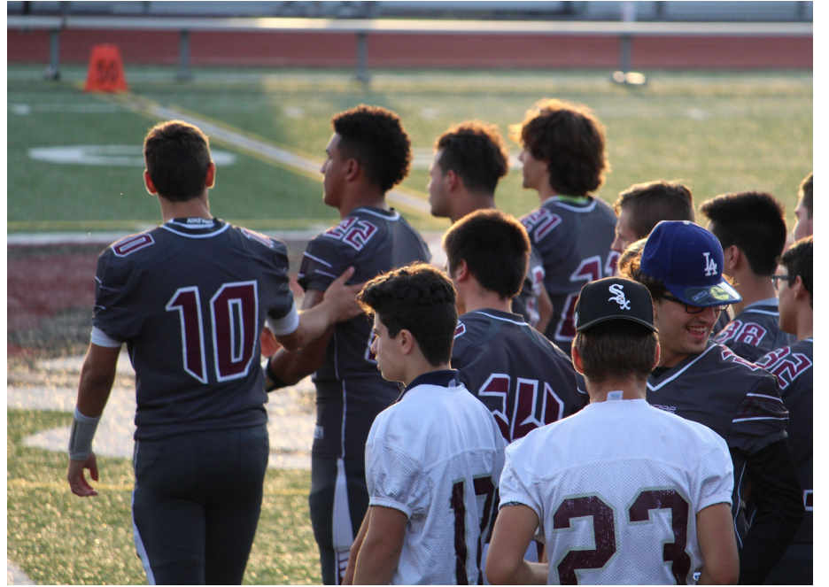
The football team is announced on the field.