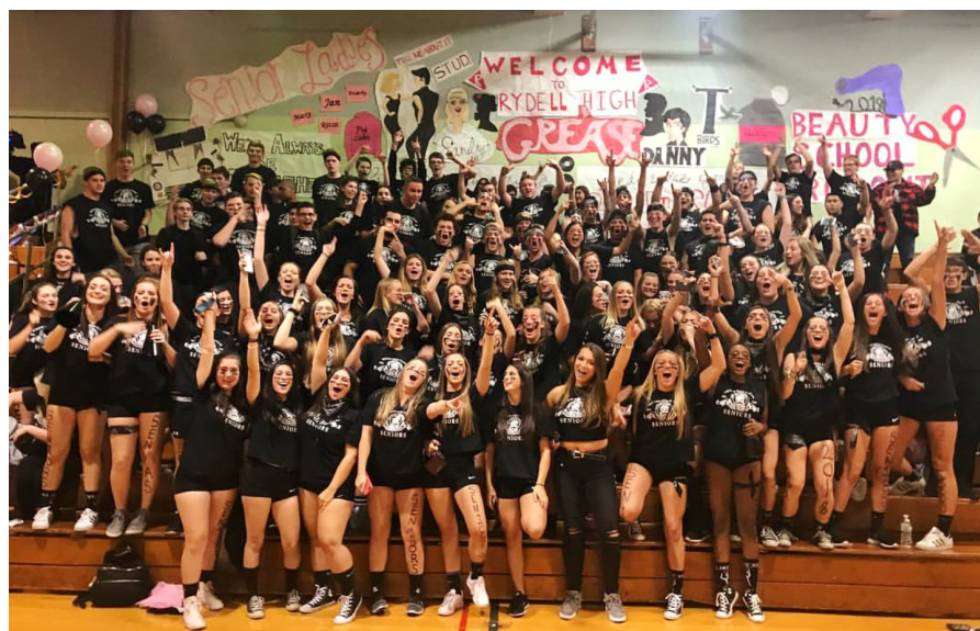
The seniors get pumped to compete.